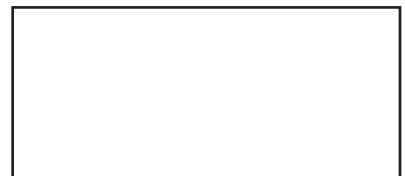
Clinic Stamp, if given at a clinic

We certify that the above information is accurate and complete: