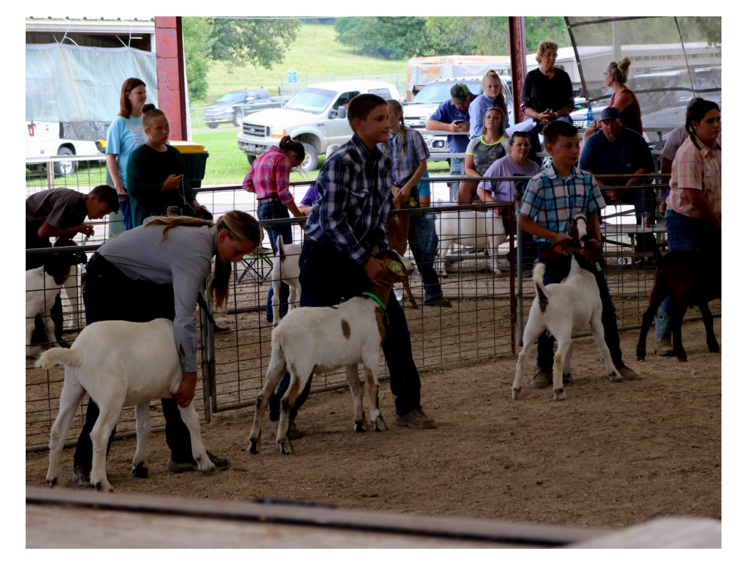
Leavenworth County Fair Goat Show 2020