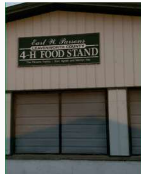
FOOD STAND SHIFTS

The food stand is open Tuesday through Saturday of Fair Week. Shifts start at 7am. The stand is open from 8am until 10pm. Check with your club to see when your club's food stand shifts are and how you can help.