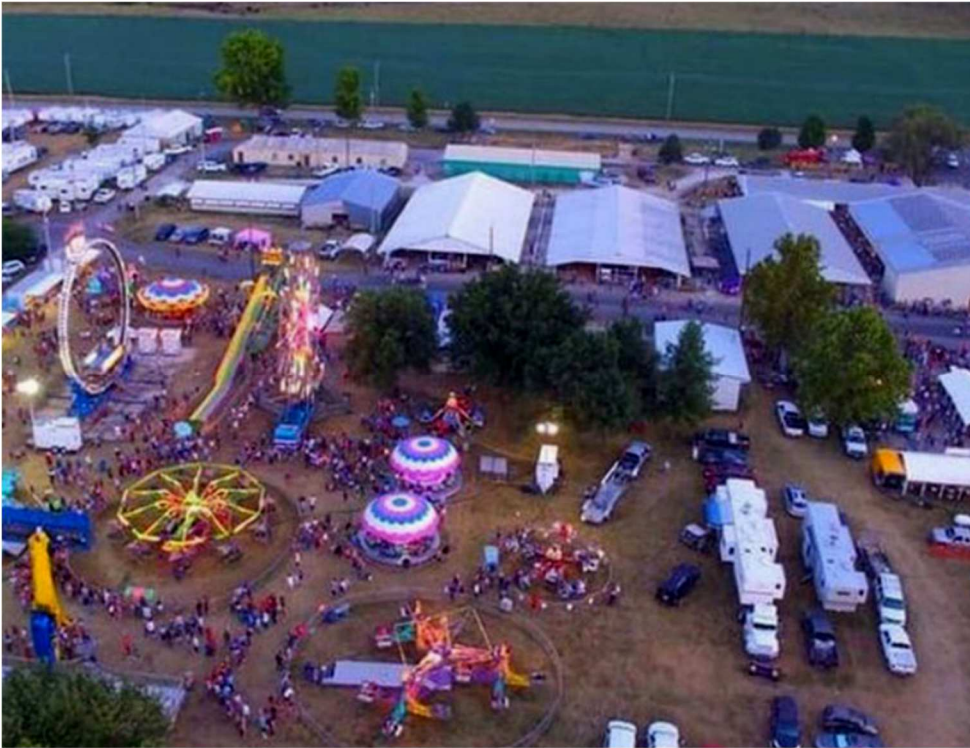
Leavenworth County Fair